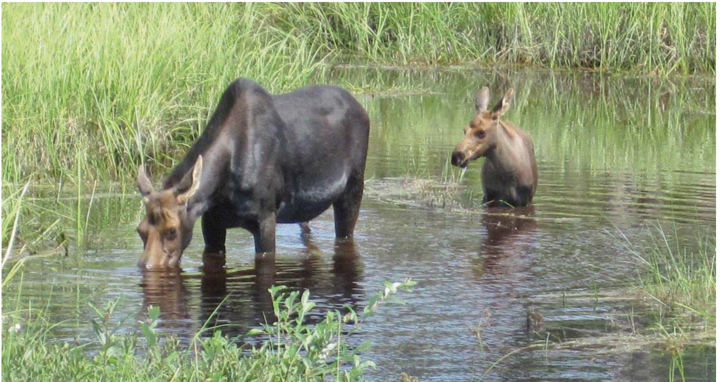
Moose mom and calf wander Chik-Wauk territory.

An added attraction could be sighting of a female moose with her calf which wander the woods and wetlands surrounding the museum. About 150 visitors arrive each day and leave with rave notices. Hours are 10 am to 5 pm daily until October 17 when the museum closes, but the hiking trails remain open all year long. If you cannot visit this fall, the museum will open again Memorial Day weekend 2011. Information at 218-388-9915 or www.chikwauk.com .