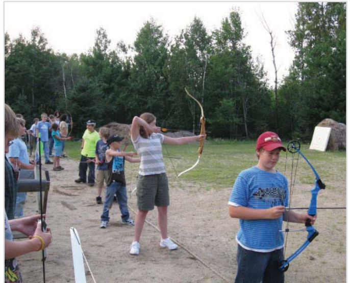
Campers practicing their archery skills.

"We swam, canoed twice, shot rifles, shot both recurved and compound bows, threw hatchets at a log end, tied flies and learned how to cast with a fly rod (OK, now it is for