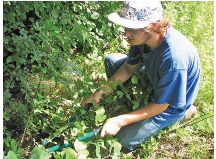
An Eagle Scout candidate attacking buckthorn at Izaak Walton Creek.

attachment for drilling holes for the seedlings. This project was the 12th habitat project New Ulm Chapter has conducted. Since 1997, they have planted almost 16,000 trees and shrubs and installed fabric weed mats to reduce competition from wildlife.