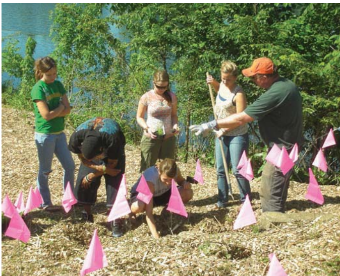
Austin Chapter 10 members hard at work planting at the Mill Pond Raingarden Project.