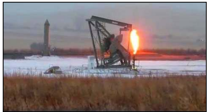
Bakken Oil Well and surrounding landscape.

"I think progress toward converting away from lead impossible without continued efforts to educate, offer alternatives, demonstrate; and, where absolutely necessary, allow exceptions when alternatives are not available. Those of us who were in attendance this past summer at the DNR sponsored information session were able to confirm that many are eager to change, that we now possess alternatives that we need to lead as hunters / fishers to keep things rolling. It was and is also clear that there is absolutely no appetite among state / federal agencies, AND, a good number of conservation organizations to use regulation. There is simply not the political will to lead. Industry and some conservation groups try to make the case that in most(emphasis on most as there are some exceptions) cases, populations of affected wildlife are fairly robust and can afford the individual morbidity and mortality. I argue that we have an obligation beyond and above those claims even when accurate. I argue that I have no right to inflict sickness / death as a result of my recreation, if there are alternatives. Swans are but one example of relatively long lived and wonderful animals that we are charged with sharing this planet. I haven't even mentioned my great-grand-kids! State and federal agencies hide behind "to wanting to go through another lead to steel shot battle." They say the scars that remain are significant."