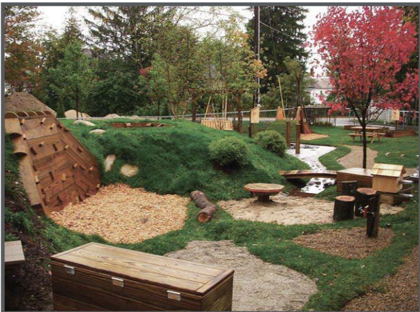
A natural playground.

A unique natural playground will be installed at the newly opened Wildwood Elementary School in Mahtomedi this year. Jaques Chapter held its June 19 meeting to update citizens about the plans and learn about the benefits of a natural play area that may feature logs, rocks and plants. Playing with natural objects can help kids be more active and creative than usual playgrounds that feature metal, plastic and brightly colored equipment.