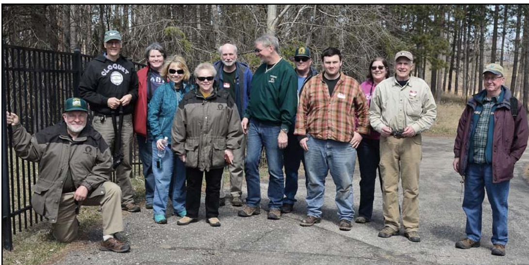
Annual Meeting delegates enjoying their visit to Tamarac National Wildlife Refuge.